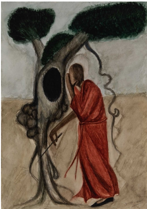
Atul Dodiya, Untitled, 2020, Watercolour on paper

' Atul Dodiya: Walking with the Waves ' an exhibition with recent works of Atul Dodiya generated from the current pandemic will open parallel to K Ramanujam's show at KNMA, Saket.