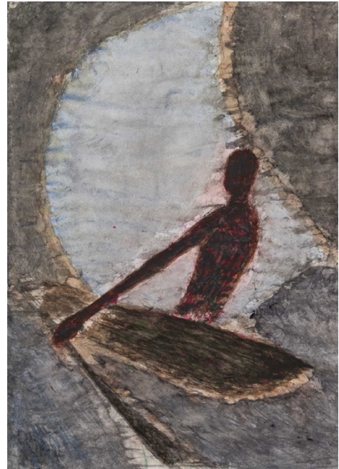
Atul Dodiya, Untitled, 2020, Watercolour on paper Image courtesy: Artist

© All images and text: Kiran Nadar Museum of Art, unless mentioned.