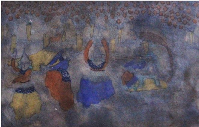
K Ramanujam, Untitled, Gouache on paper Collection: KNMA

Paying homage to K Ramanujam, an exceptional figure of Indian modernism, the exhibition ' K Ramanujam: Into the Moonlight Parade... ' provides the audience a unique opportunity to view rare drawings and paintings of the artist including his awe-inspiring 13-foot panorama 'My Dream World' (1973).